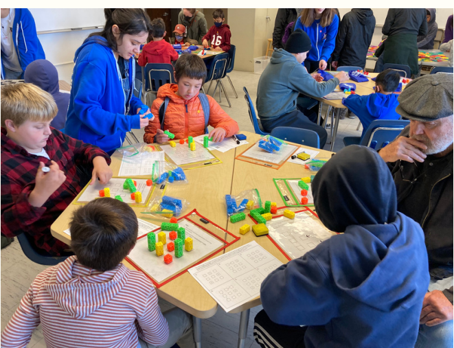
SF Math Circle Festival

Visit our website to learn more about Teacher Fellows and consider applying to our program.